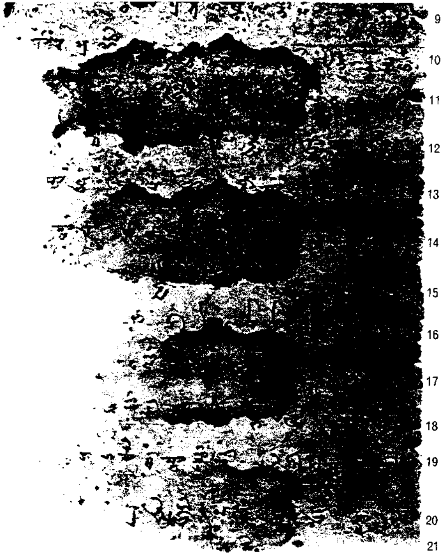
PLATE II (9-21 recto)