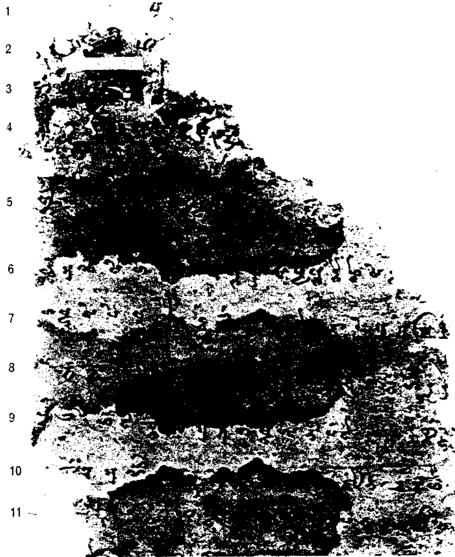
PLATE I (1-11 recto)